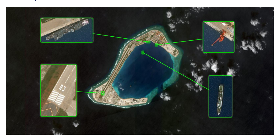
WorldView-3 | 08/20/2019 | Pan Sharpened Natural Color